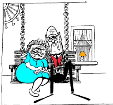
It’s an ageless process.

If you have this problem, there is new information for you. It seems that the Us-part doesn’t age very much. People can be romantic and get infatuated and go through all the courting steps at virtually any age.